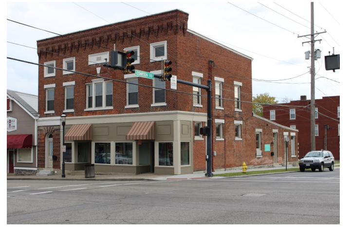
The corner of Hamilton and Compton, looking northeast. The water tower was torn down in the mid-1960s.