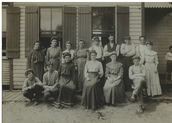
Labeled as tailor shop, possibly on Elizabeth.

This month we're highlighting a few of the more mysterious ones. If you have any information or additional photos of these, please let us know.