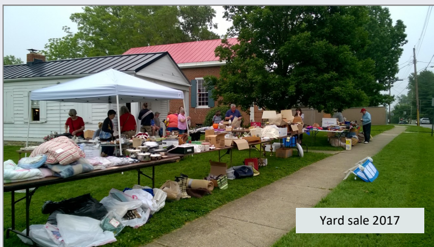
Yard sale 2017